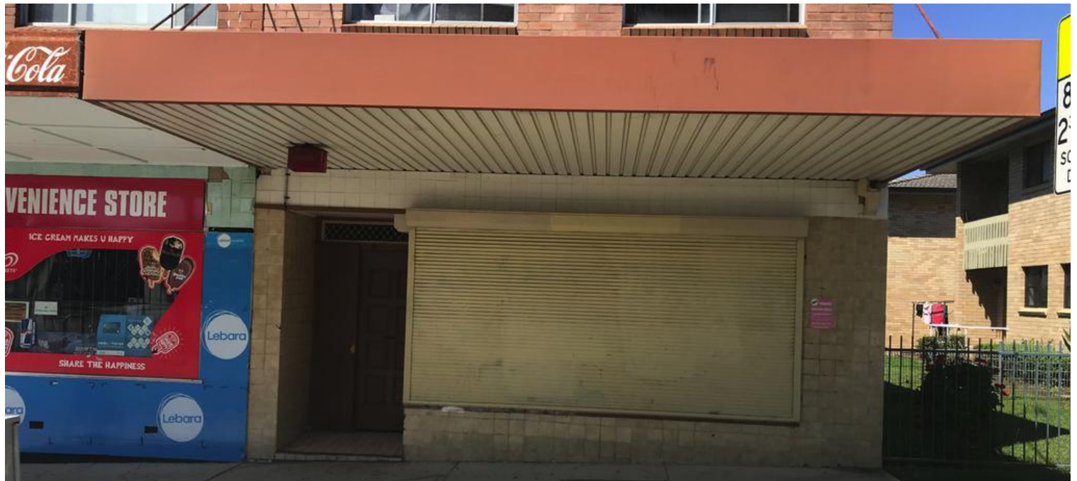
3 Lehn Rd, East Hills