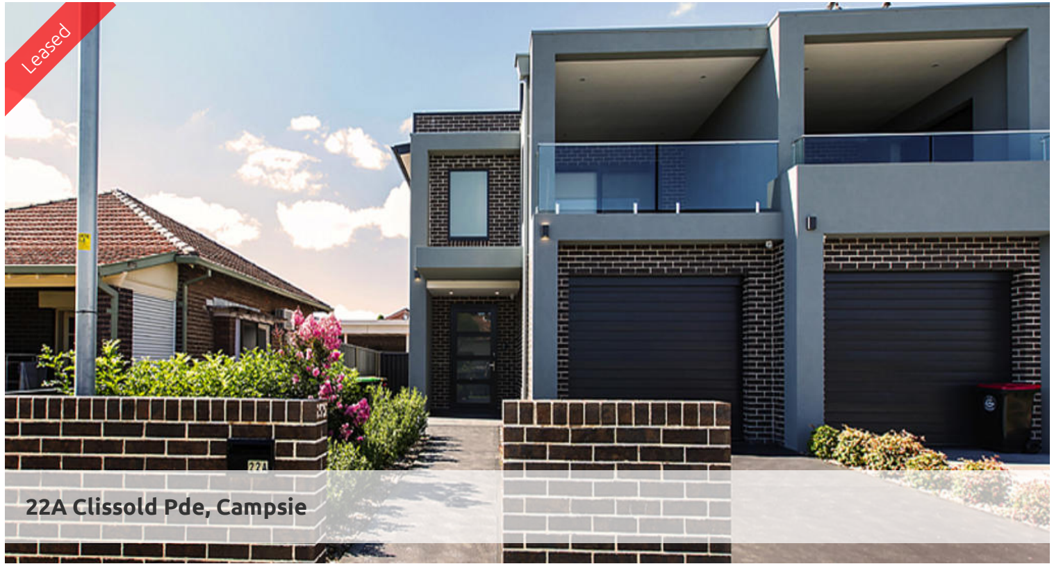
22A Clissold Pde, Campsie