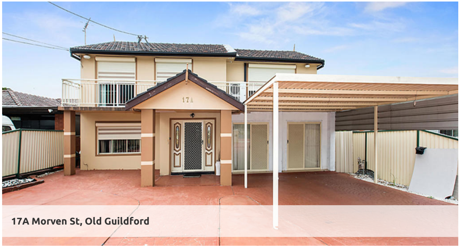
17A Morven St, Old Guildford